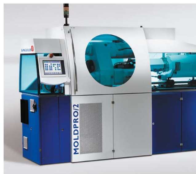
Dedicated All-Electric Injection Molding Machine for Thin-Wall Medical Parts