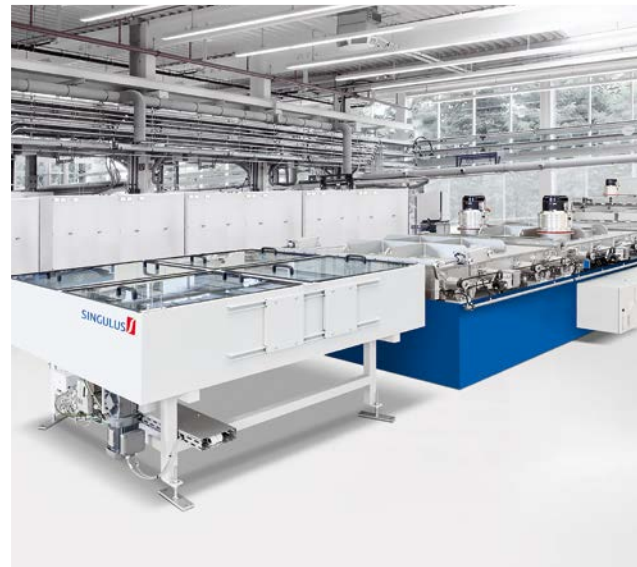
Inline Sputtering System with Horizontal Substrate Transport for Flat Substrates

A variety of deposition materials, e.g. the wide range of metals, metal alloys and ceramics, is available for the respective application. Flat substrates can be processed but also 3-dimensional parts by either simultaneous deposition from different directions or part rotation during deposition. Our production systems typically feature single substrate/parts tracking, in-line quality control, closed loop process stabilization and are fully automated to reduce logistical efforts and personnel intensity.