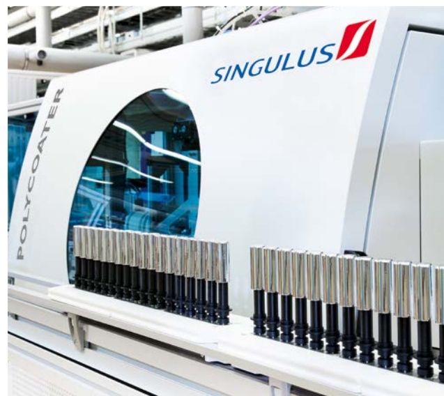
POLYCOATER Inline Sputtering System for 3D Parts