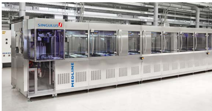
Inline wet processing system for cleaning and coating of contact lenses